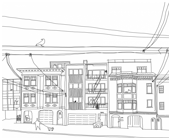
Fig. 4. Katarzyna Siedlecka, San Francisco , 2020, https://dessinetafenetre.org/galerie-dessinetafenetre [accessed: 06/09/2021].