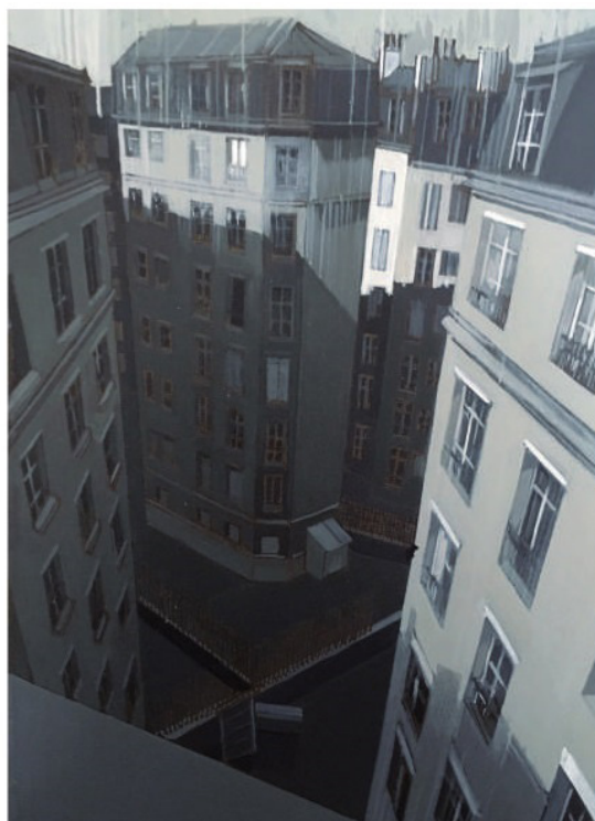
Fig. 1. Olivier Massebeuf, The Courtyard , 2020, https://www.instagram.com/p/B-2ifuVqVsQ/ [accessed: 5/09/2021].

An analysis of the works posted on the project website makes it possible to identify a few prominent representation trends. The first is to show just the view from the window without highlighting the window frames or interior elements. Françoise Coulon presented a view of the empty garden. A bench and a table with two chairs seem to be open to the viewer's presence and invite him to relax. The perspective from which the scene is presented bridges the distance between the garden and the viewer, who might remain unaware of the existing barrier. One gets the impression that the artist is standing in the garden and deciding where they should sit. The absence of elements such as a window sill or a window frame and the colours of the painting, especially the dominance of green, emphasise optimism and shorten the distance between confinement and freedom, even though the painting is characterised by solitude and the absence of human figures, the outside world appears as something close at hand.