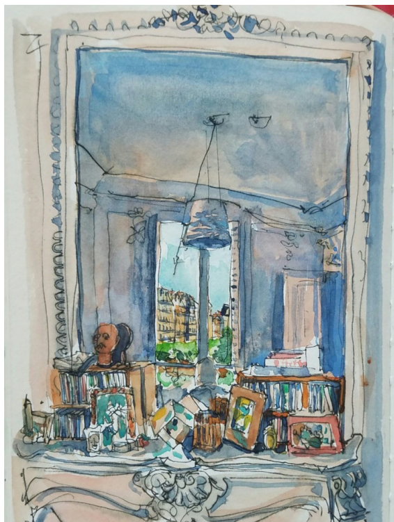
Fig. 3. Bénédicte Roullier, Paris 14 , 2020 https://dessinetafenetre.org/galerie-dessinetafenetre [accessed: 06/09/2021].

The last distinguishable group is the representations of people inscribed in the window's context. Artists like Sylvain Cnudde paint self-portraits. On the left side of the canvas, the artist has depicted a view of vegetation almost entering the bedroom through an open window and the neighbouring residential buildings. On the right, however, he presented his self-portrait while drawing in the reflection of a windowpane. This emphasises the impossibility of crossing the transparent barrier of the window, even when it remains open. There are also views of lonely people on the streets. Katarzyna Siedlecka presented a view of one of the streets of San Francisco. On the opposite pavement, the author sees a figure walking a dog. In addition, in the windows of the building opposite, we see several other figures looking out onto the street, alone or in pairs. The sketchy nature of the figures makes it impossible to identify them, and the anonymous outlines of the silhouettes do not represent specific people but are such a familiar phenomenon regardless of the location. Despite the proximity of neighbours and passers-by, we remain alone, each in his world separated from the others by a pane of glass, and the contour outline further visually distances us from the seemingly close people we cannot get to know due to lockdown. It is irrelevant whether the window opens onto a cityscape or nature. Experiences of loneliness, alienation, and anxiety characterise most of the works presented.