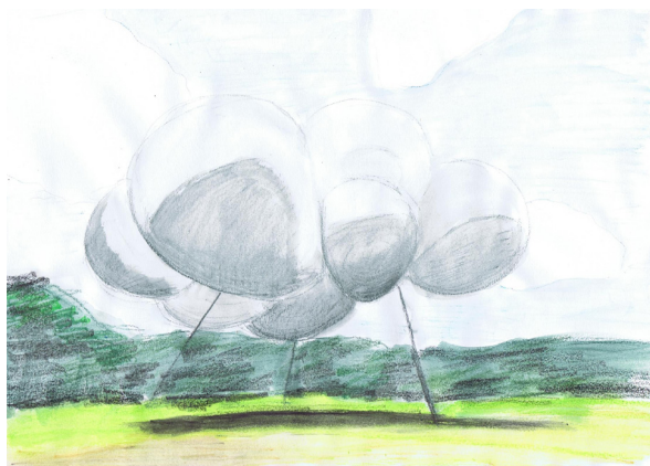
Fig. 6. Sou Fujimoto, Cloud Pavilion

Kazuyo Sejima, the co-founder of SANAA, reiterated the theme of the meandering river this time in the historic Hama-Rikyu Gardens. The Sumei of her own design was an installation rather than a pavilion. It reflected the nearby skyscrapers, embracing both ancient and modern Tokyo.