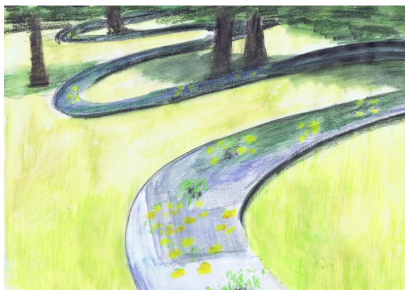
Fig. 7. Kazuyo Sejima, Sumei

The world is changing, and staying in place. Just like water. If the flow stops, the water will become stagnant. Likewise, Tokyo is always on the move, which we hope will lead to a pure future 39 .