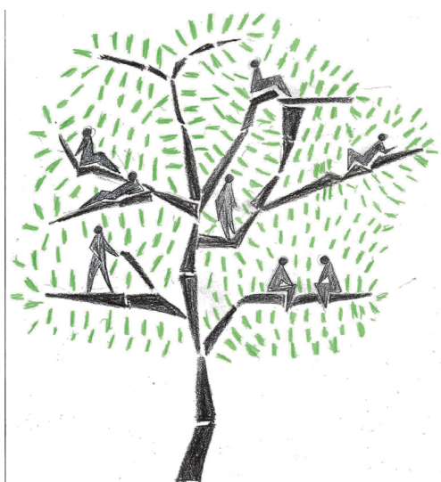
Fig. 3. The tree principal diagram being the inspiration for House NA , author: J. Łapińska based on https://www.archdaily.com/230533/house-na-sou-fujimoto-architects/50180b0028ba0d49f5001690-house-na-sou-fujimoto-architects-diagram-01?next_project=no [accessed: 23/09/2021].

The white steel-frame structure itself shares no resemblance to a tree. Yet the life lived and the moments experienced in this space is a contemporary adaptation of the richness once experienced by the ancient predecessors from the time when they inhabited trees 20 .