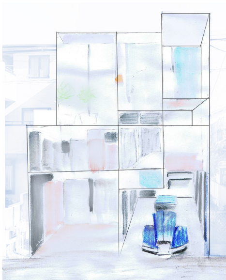
Fig. 2. Sou Fujimoto, House Na , author: J. Łapińska, based on photography by Iwan Baan, https://www.archdaily.com/230533/house-na-sou-fujimoto-architects/50180b3528ba0d49f5001698-house-na-sou-fujimoto-architects-photo [accessed 23/09/2021].

The idea behind the creation of this building was the need to be a nomad in your own home. Fujimoto fulfilled it in an original way, arranging 85 square meters of space on 21 independent platforms with a floor area of 2 to 7.5 square meters, placed at different heights across three standard floors interconnected by stairs and ladders. These platforms, with a loosely defined function, are in the scale of furniture, not rooms, so together with elements of vertical communication, they can take on different roles, such as a passage, desk, seat or partition, but also like leaves in the treetops they can filter light, painting shimmering shadows on the surfaces.