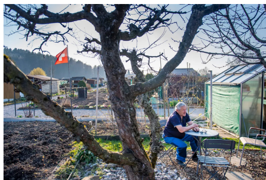
Fig. 9. Gossau elders using allotment gardens during the pandemic, https://www.tagblatt.ch/ostschweiz/stgallen/gossauer-senioren-lassen-sich-ihr-paradies-nicht-nehmen-schrebergaerten-mooswiesen-werden-zu-m-zufluchtsort-in-der-coronakrise-ld.1207211 [accessed: 28/02/2022].