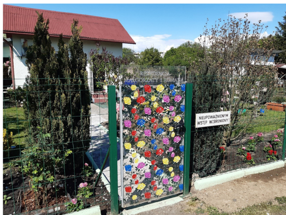
From left: Fig. 14. The magic of blue, photo: author of the article. Fig. 15. No trespassing, photo: author of the article.