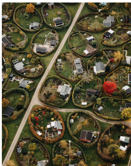
Fig. 3. Circular Magic, Facebook, https://www.f7dobry.com/unikalne-owalne-ogrody-wspolnotowe-w-kopenhadze/ [accessed: 28/02/2022].