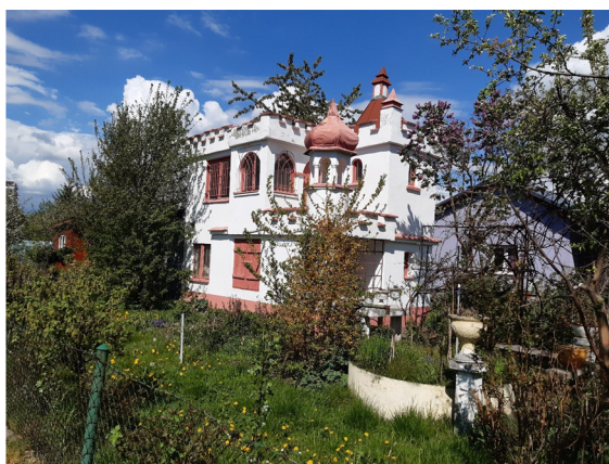
From left: Fig. 12. Kraków – Łęg, photo: author of the article. Fig. 13. A palace from a thousand and one fairy tales, photo: author of the article