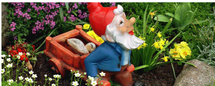
Fig. 1. There are probably around 25 million dwarves in German gardens. https://www.tagesspiegel.de/berlin/kleingarten-als-bauland-weniger-gaerten-fuer-einzelne-mehr-flaeche-fuer-alle/26020012.html [accessed: 28/02/2022].

Allotment gardens blended into the residential, commercial and industrial developments form together with them one common urban organism. They fill a spatial void and have a positive effect on the urban physiognomy. The users' care for their parcels transformed former wastelands, rubbish dumps and undeveloped areas into colourful places teeming with life. Users introduce interesting architectural solutions, often expressed in original shapes and forms of gazebos. 7