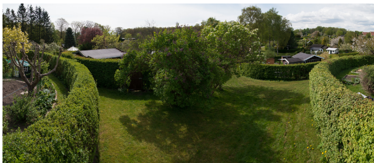
Fig. 2. Oval gardens – an attraction of Copenhagen, Flickr/Ben ter Mull, https://brightvibes.com/2357/en/the-story-behind-the-unique-oval-community-gardens-of-copenhagen [accessed: 28/02/2022].