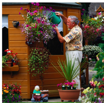
From left: Fig. 18. A splash of colour, Fig. 19. Allotment in a German style – garden dwarves and barbecued sausages, https://www.welt.de/icon/article143753689/Die-liebenswerten-Zwaenge-in-deutschen-Kleingarten.html [accessed: 28/02/2022].