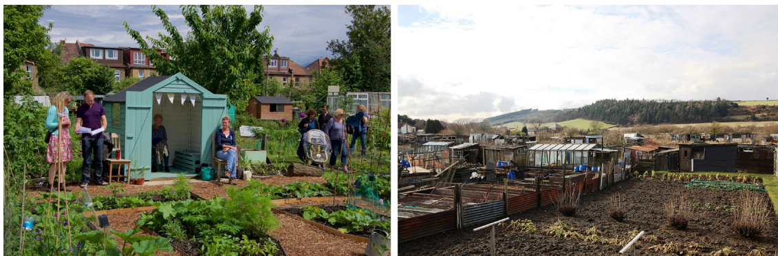
From left: Fig. 4. Allotment in England – arranged in the ‘potager garden’ style, https://ealingdean.co.uk/events/2016/potager [accessed: 28/02/2022].

ecological cities that counter food security threats, combat climate change and protect pollinating insects.