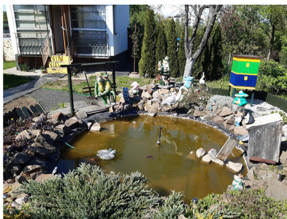
From left: Fig. 16. Exotic corner, photo: author of the article. Fig. 17. Pond with red fish, photo: author of the article.