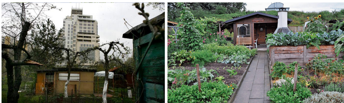
From left: Fig. 7. Allotment in the city centre, photo: Kuba Kamiński, https://www.rp.pl/nieruchomosci/art4585691-ogrodki-dzialkowe-wracaja-do-dawnych-wlascieli [accessed: 28/02/2022].

skyscrapers seem soulless compared to the colourful buildings speckled with multicoloured vegetation. Leaving the space of their own fairy tale, the allotment holders return to the outside, real world through the ROD gate which is a kind of passage between the two realities. They leave their uniforms, in which they proudly stroll through these enchanted gardens, in the allotment premises. The gazebos hide the dungarees, cowboy hats and wellingtons along with dreams of moving to another carefree dimension.