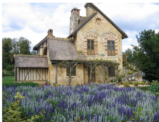
Fig. 6. Marie Antoinette’s vegetable garden, Hameau de la Reine in the Petit Trianon grounds, Versailles, https://en.wikipedia.org/wiki/Hameau_de_la_Reine#/media/File:Ferme1.jpg [accessed: 28/02/2022].

Perhaps one of the first users of an allotment garden was actually Marie Antoinette. Strolling around, dressed as a shepherdess, the young queen, grazing geese, feeding little lambs, picking ripe raspberries and lettuce leaves, embodied a dreamlike carefree character. The most important thing for her was to be able to get away from the daily problems left behind in the huge palace. Her small country house looked like a dwarf’s cottage against the backdrop of the huge Versailles estate. A similar impression is created by contemporary gazebos installed in small gardens located in city centres. The contrast between the real life going on outside the ROD allotment gardens’ fence and the interior of these small private worlds is astonishing. Emerging from behind a hedge, the lumps of concrete